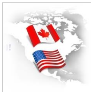
110V / 120V OUTPUT